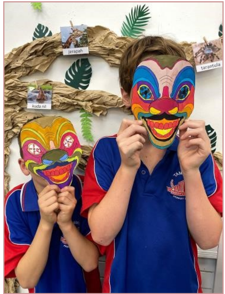
The year 3—6 have been exploring “Topeng” - Indonesian Ceremony/Performance masks.