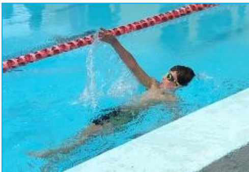
Tammin Primary School Team